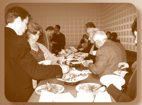
Friends of PARC enjoy the reception