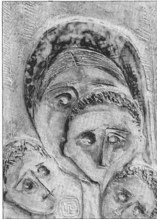
Vera Tamari – Apprehension